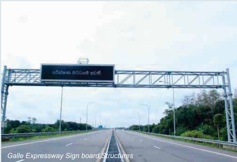
Galle Expressway Sign board Structures

All functions starting from the ordering of raw material up to the transferring of the end products to the customers are planned and monitored by the use of a computer software designed to record every aspect of the production process with dates for fabrication, galvanizing, shop assembly of sample, packing, final inspection and delivery. This ensure timeliness and resultantly maximizing of customer satisfaction. Our dedicated staff from engineers to workmen is fully focused to serve our customers to their satisfaction at all times.