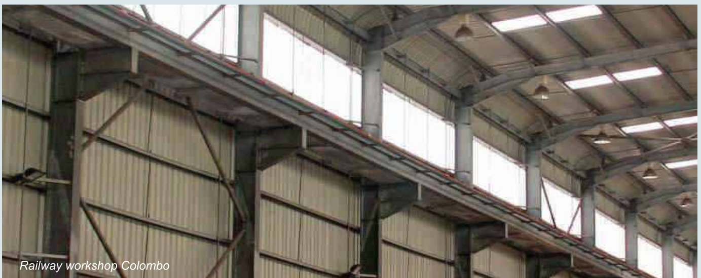
Railway workshop Colombo