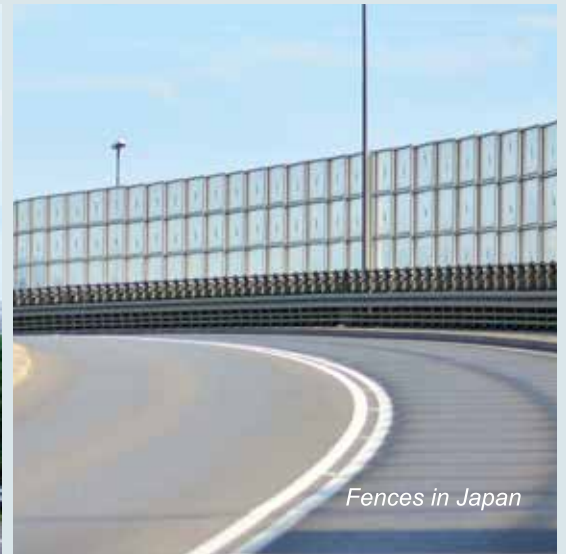
Fences in Japan